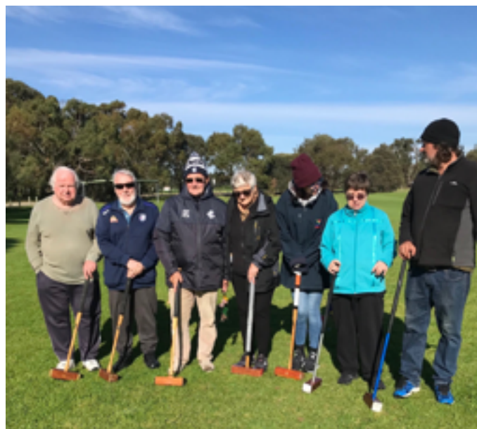
RNB Croquet Club plays on pop-up courts they set out on public parklands, making it accessible to people who aren't able to use their mobility aid on traditional croquet courts.